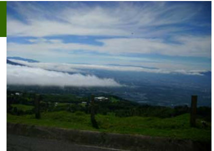
Mountainside in San Jose, Costa Rica headed to Paos Volcano

The Florida West Coast Chapter is very pleased to announce that we will be hosting the 2011 August Chapters Regional Conference at our Section in San Jose Costa Rica. The hotel will be in the capital of Costa Rica, but there will be opportunity to travel and experience the 12 microclimates. The country is about 200 miles wide so there is opportunity to go coast to coast, visit a volcano or extend into the clouds at 12,000 ft.